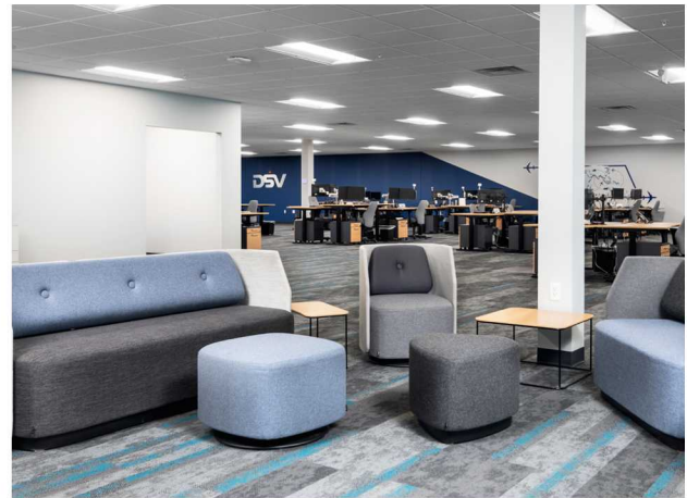
Logistics office space leased, designed, and built by Corporex.

Corporex does not believe in a "one-size-fits-all" approach to leasing agreements and contracts. From offering a competitive rent structure to taking a creative approach to leasing agreements as business needs fluctuate, Corporex customizes agreements based on each individual business model. They have a deep portfolio of assets which enable flexibility in meeting a company's ever-changing needs through growth and retraction.