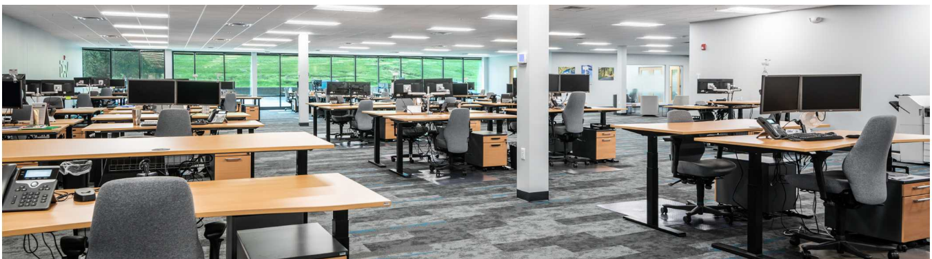
Logistics office space leased, designed, and built by Corporex.

Due to Corporex's location, long-standing community partnerships, ability to create flexible leasing agreements, and provide customized options with top-tier amenities to tenants, they excel at providing office solutions in third-party logistics companies (3PL).