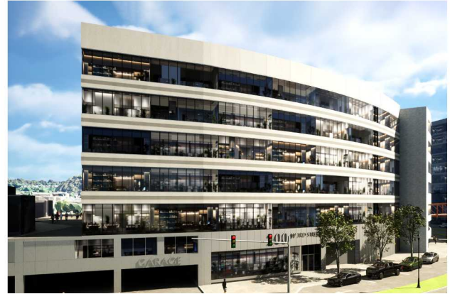
Ovation Office | rendering, future home of MegaCorp Logistics.

The company started with 8,000 square feet, grew to 19,000 square feet in RiverCenter and will move to a brand new 40,000-square-foot space as the anchor tenant of Corporex’s brand new 100,000 square foot, five-story office building located at 200 W. Third St. in Newport, Ky within Ovation.