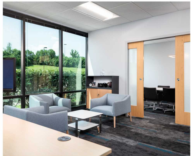
Logistics office space leased, designed, and built by Corporex.

As individual business needs change, Corporex understands the importance of being flexible and customizing each construction plan, lease agreement, interior design model and more to bring a client’s vision to life. Corporex has combined strong local and government connections, an understanding of each individual business’s desires and industry, the ability to be creative and nimble with agreements, and the flexibility to adjust based on a company’s evolution to create world-class office buildings for countless tenants. To learn more about Corporex and its extensive portfolio of businesses and investments, visit corporex.com .